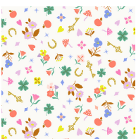
LUCK1008 1 FQ