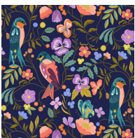
LUCK1001 1 FQ