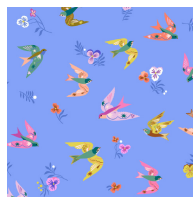
LUCK1004 1 3/4 yards