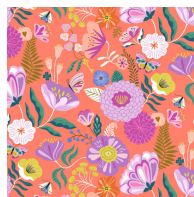
LUCK1003 1 FQ