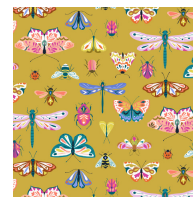
LUCK1006 1 FQ