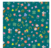
LUCK1007 1 FQ